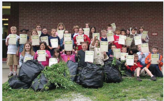
Grade 4 at Clarendon Elementary school with bags of garlic mustard and WOW! certificates.

their inventory, and expand understanding so private landowners, government agencies, and homeowners know what to watch for and how to control it." WOW! is using a multi-pronged approach, including recruiting highly visible demonstration sites, hosting workshops for targeted audiences, producing brochures and a website, and conducting media outreach.